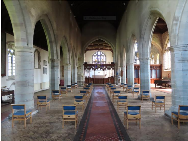
A sign of the times ... seating spaced for safety at St Andrew's